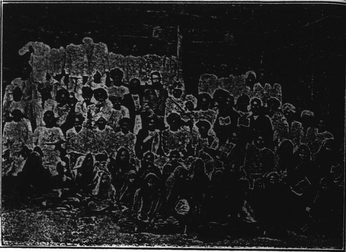
CHURCH OF CHRIST. VAMBORI, INDIA ALL CONVERTS EXCEPT THE INFANTS