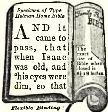
Specimen of Type Holman Home Bible

AND it came to pass, that when Isaac was old, and his eyes were dim, so that