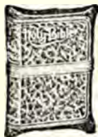
Size 5 3/4 x 3 1/2 inches.

The text is self-pronouncing, by the aid of which children can learn to pronounce the difficult Scripture proper names.