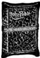
Size 5x3 3/4 inches.

The text is self-pronouncing by the aid of which children can learn to pronounce the difficult Scripture proper names.