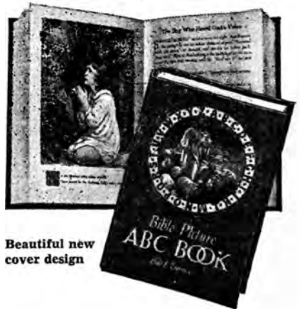
Beautiful new cover design