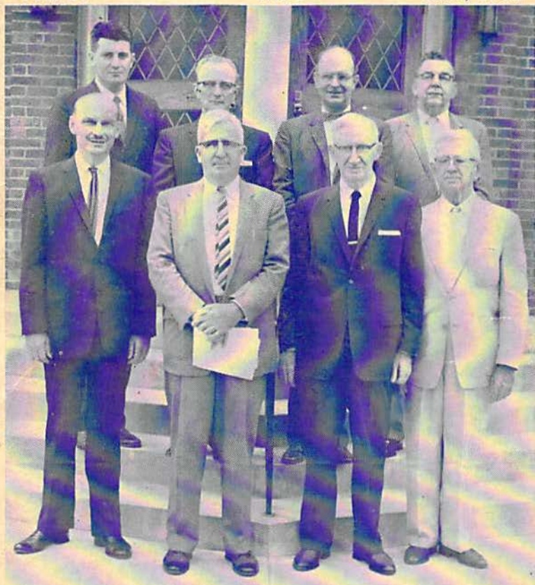
Each Man To His Work (See inside front cover)