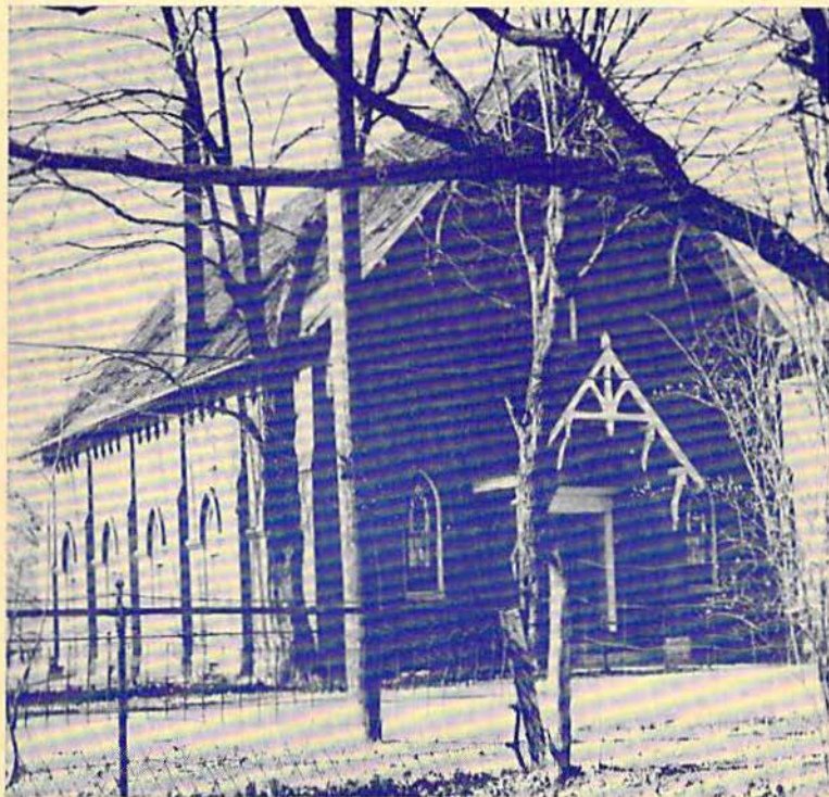
UTICA, INDIANA CHURCH OF CHRIST