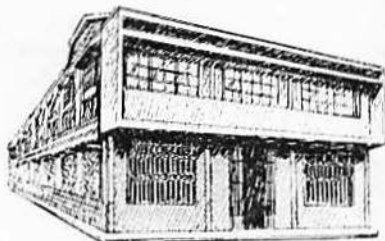
A NEW HOME FOR C. B. I.