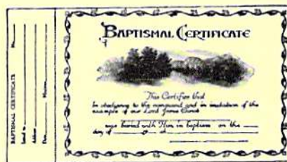
Book of Baptismal Certificates, No. 440

Fifty certificates, bound in check-book form, with perforated stub for keeping a record of each certificate. 5 1/2 x 8 1/4 in. Certificates are unusually attractive, lithographed in four colors, reproducing a painting of the river Jordan. PRICE $1.50