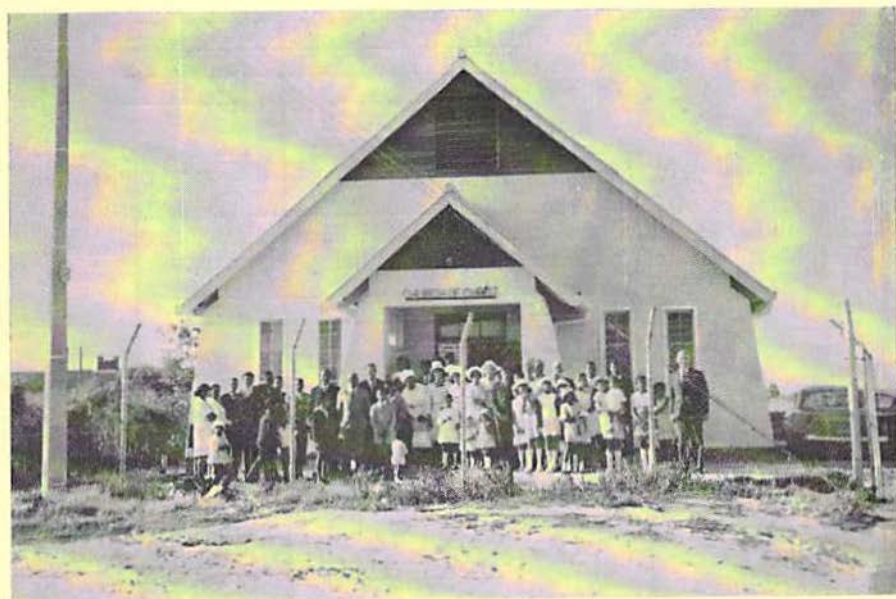
BONTEHEUWEL BUILDING—MONUMENT OF FAITH